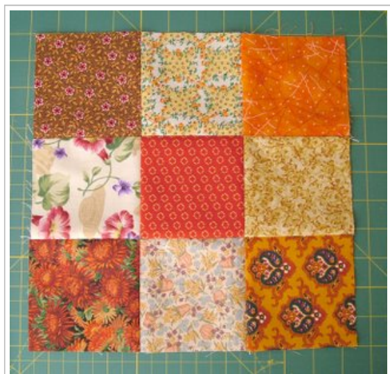
the X of the 9 patch.

The Disappearing 9 Patch block is great. Very easy to make, but looks quite impressive when done! I first discovered it in a book called "Magic Pillows, Hidden Quilts" by Karin Hellaby. I've since seen it on line in various places and using different names. Here's a little tutorial on how to make a scrappy version.